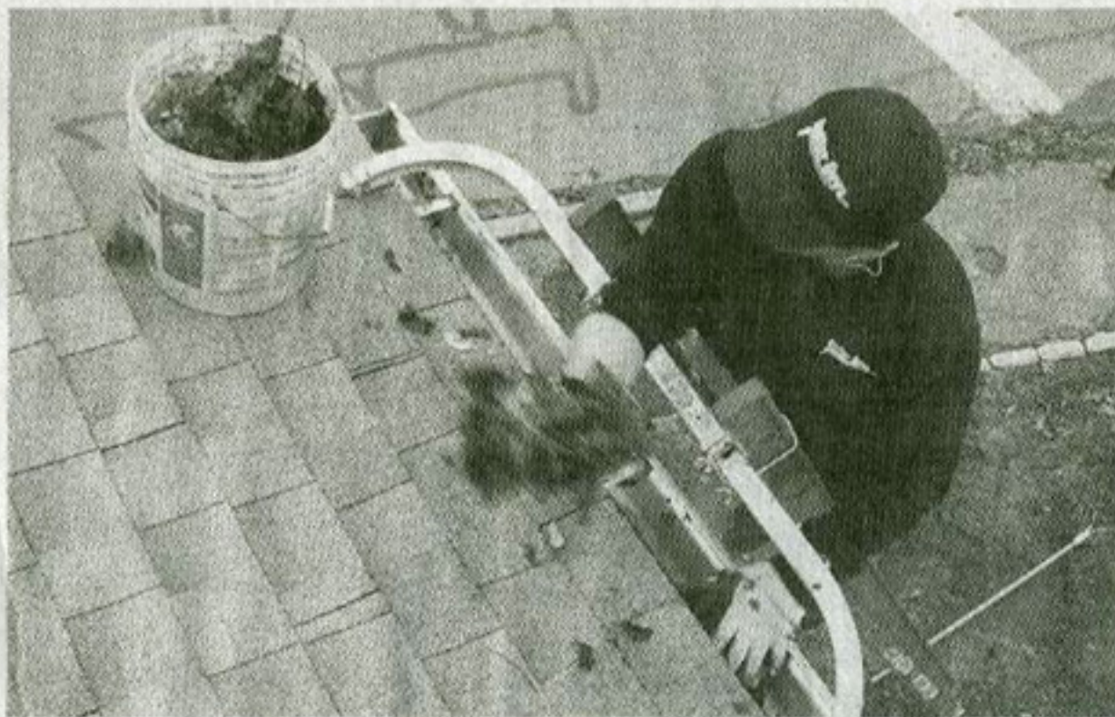
Gutter Guys has many customers who value their expert service in maintenance and repair.

Alex continued, "You have to be careful when buying a gutter system — always read the fine print. No gutter is completely maintenance-free; you can reduce the level of maintenance, but never completely eliminate it. We can install a new system if the evaluation shows that the existing system is not working for the house, but many times minor repairs are all that is necessary."